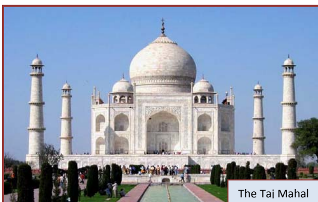
The Taj Mahal