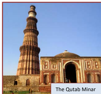
The Qutab Minar